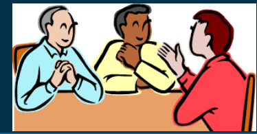
Interaction ESA ↔ Company