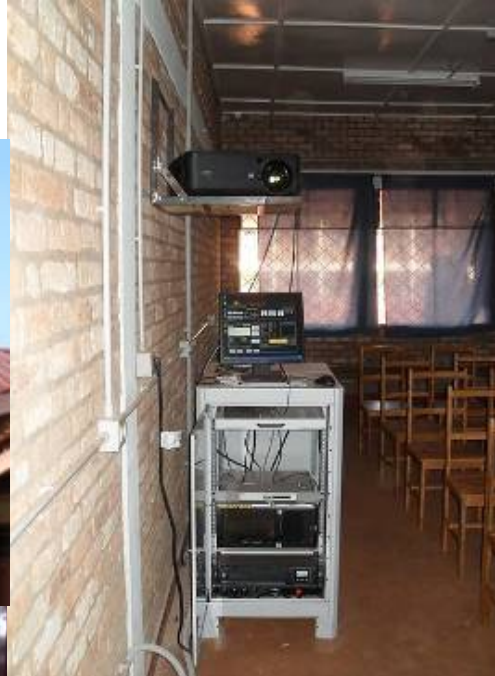
Projector and PC console in Burundi