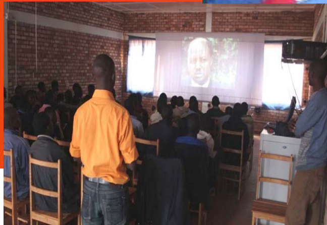
Lesson about local History (Burundi)