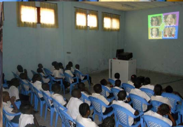
Entertainment for pupils (Kinshasa - DRC)