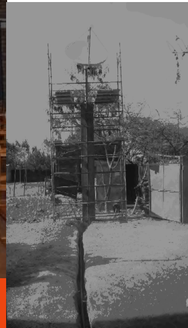
Antenna in Ouagadougou (Burkina Faso), to prevent theft and damages caused by transit of big animals