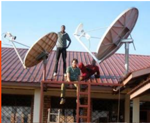
Antennas in Burundi