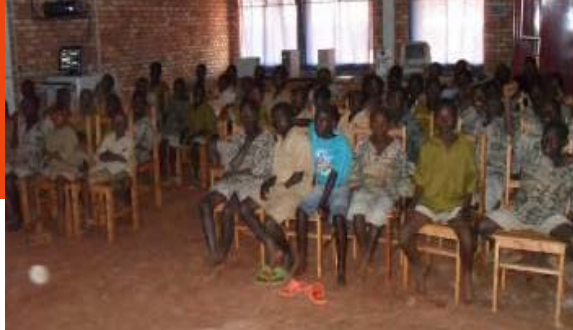
Classroom in Burundi